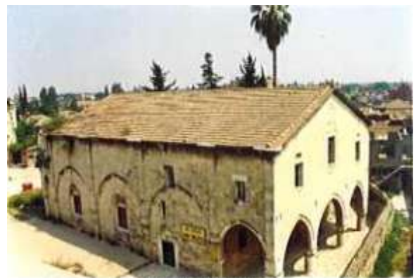
Church of St. Paul

The most famous person associated with Tarsus in religious history is Paul the Apostle . Paul was born a Jew of the tribe of Benjamin in Tarsus about AD 10 and spent his early years here. His father was a Roman citizen; Paul inherited that citizenship and its rights