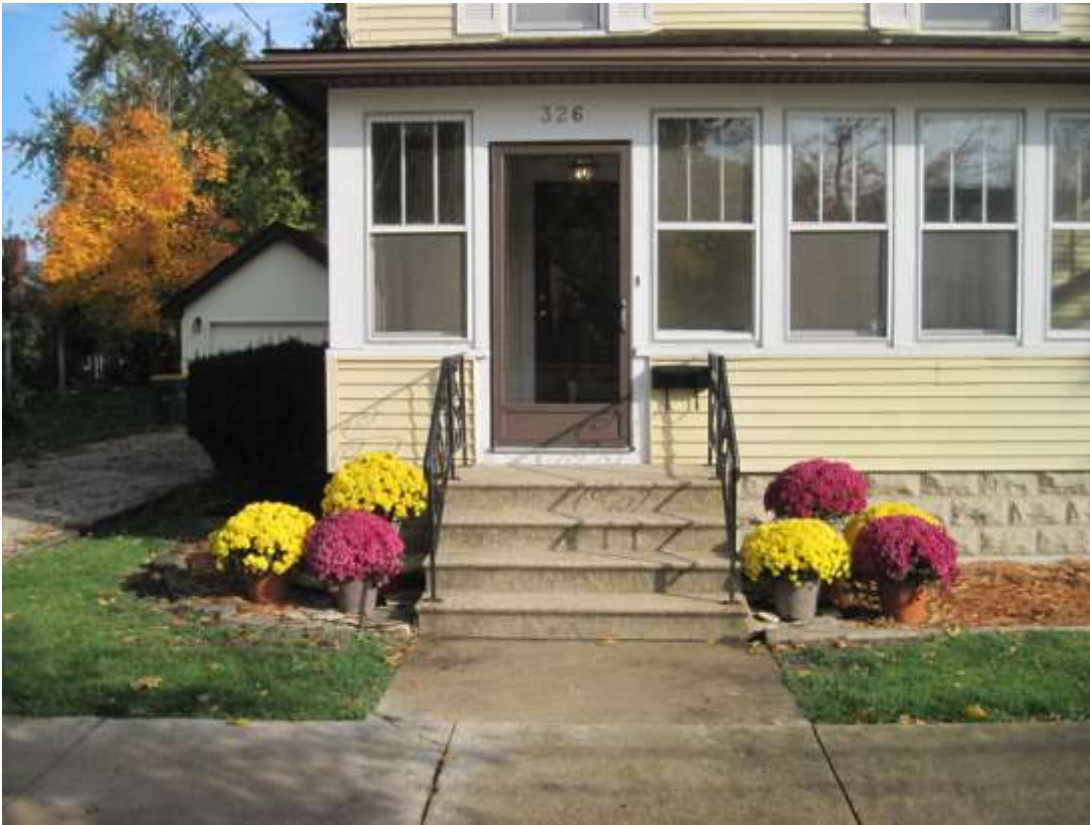
Above is the cleaned up front entrance to the Rectory. Below, on the left is the redone stairs to the upstairs bedrooms. And on the right is the refinished dining room.