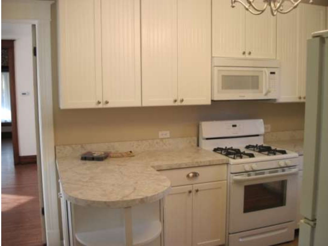
The kitchen— complete with new cabinetry, stove, sink, and dishwasher.